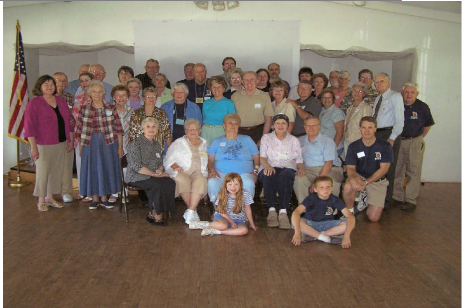
2006 Brandywine Crucible Family Reunion Attendees

Cox Family Reunion May 2006 Announcement Births Military Graduations Memorial Funds Obituary Brandywine Golf Tournament Historic Tour of North Carolina Cox Family Reunion Notices Biographies